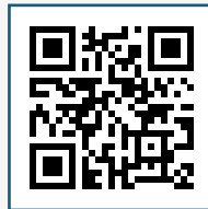
Product and Reimbursement Information US-COV-2500271