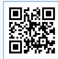
Product and Reimbursement Information US-RSV-2500005